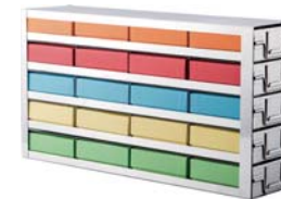
Drawer Type:5 Layers and 4 Columns (ZKL304-542B-CT)

We will recommend the perfect frozen layer rack matching scheme to improve freezer space utilization and satisfy storage requirements of biobanks.