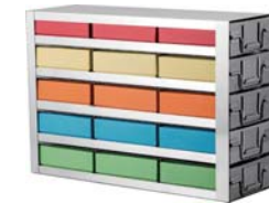
Drawer Type:5 Layers and 3 Columns (ZKL304-532B-CT)